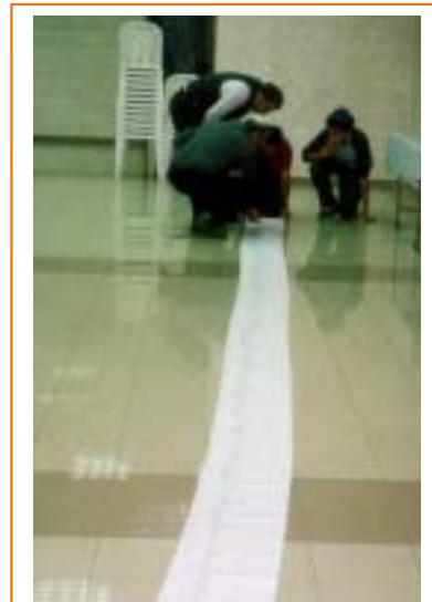
Studying Ten Generations A printout is more than 70 pages, and is 9 meters wide